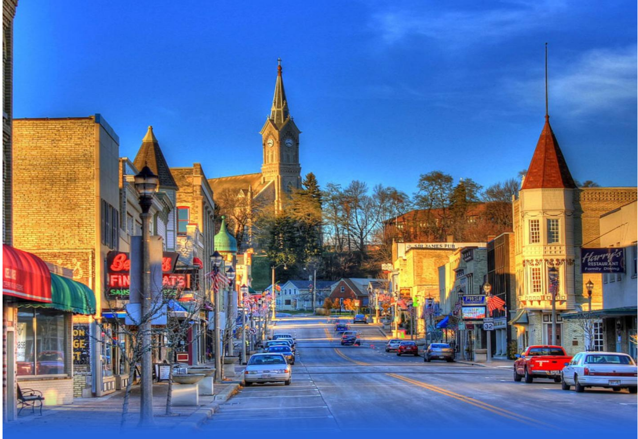
Looking North from Wall 1 is the Historic Franklin Street Downtown District. The red awning seen on the left of the photo is the front of the building for Wall 1.