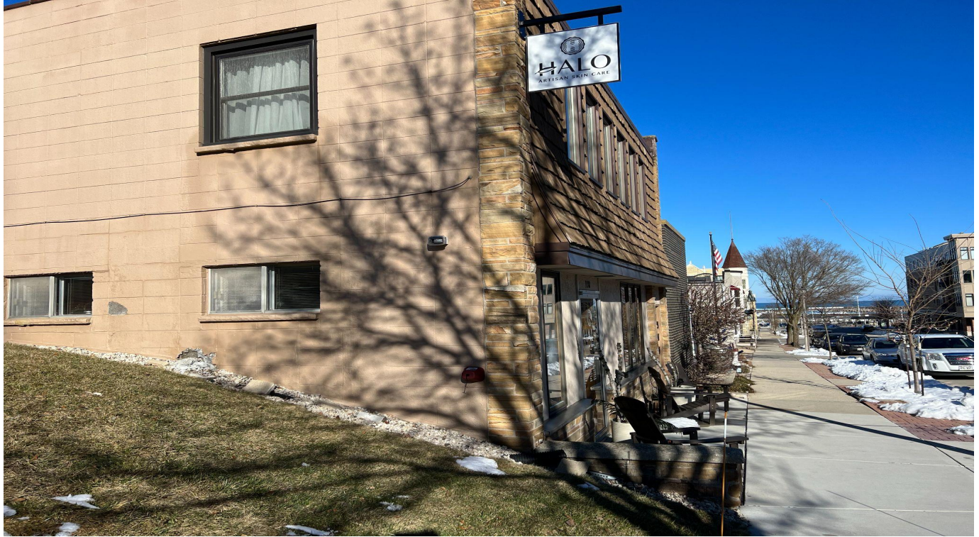
Halo Artisan Skincare Building 110 E Main Street West facing wall with a 6-foot wide grassy sloped area adjacent to the building