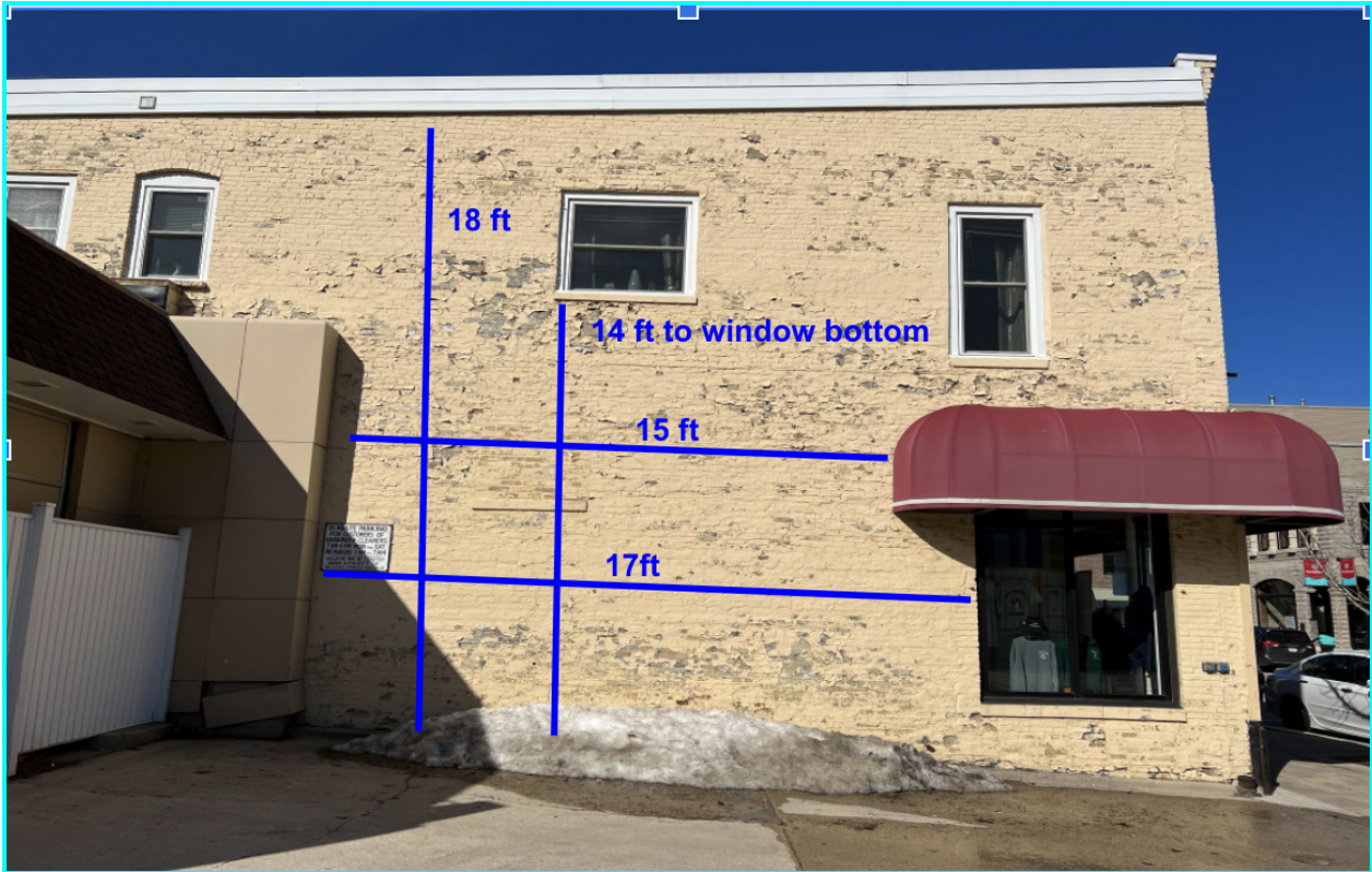
Useldings Building 107 N Franklin St South facing wall

This building sits at the entrance to our Historic Franklin Street, which is on the National Register for Historic Places. The downtown features more pre-Civil War era buildings than any other downtown in the state of Wisconsin. This particular mural needs to fit in with the historic context and nature of the city (see link to City of Port Washington history above).